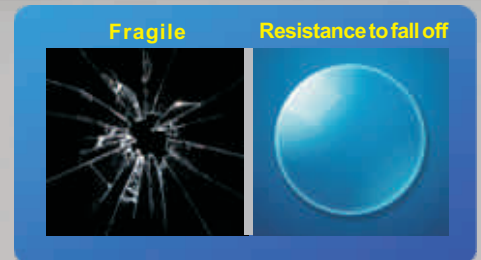
Traditional Quartz lens