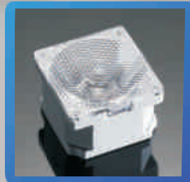
Powerful Nichia UV LEDs